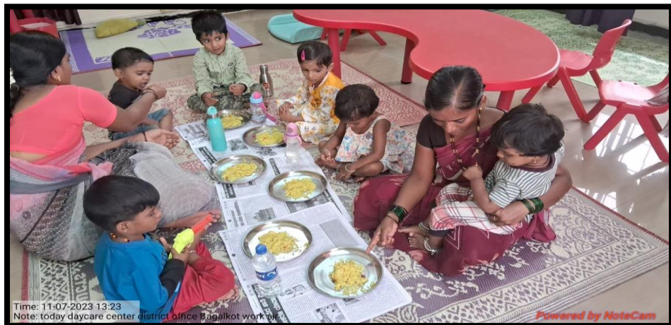
Time: 11-07-2023 13:23 Note: today daycare center district office Bagalkot work sir