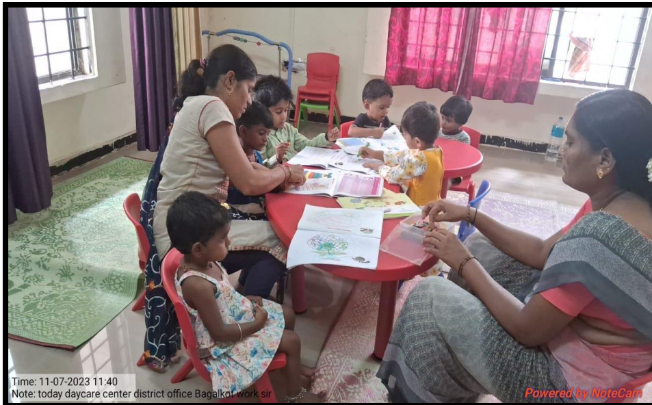
Time: 11-07-2023 11:40 Note: today daycare center district office Bagalkot work sir